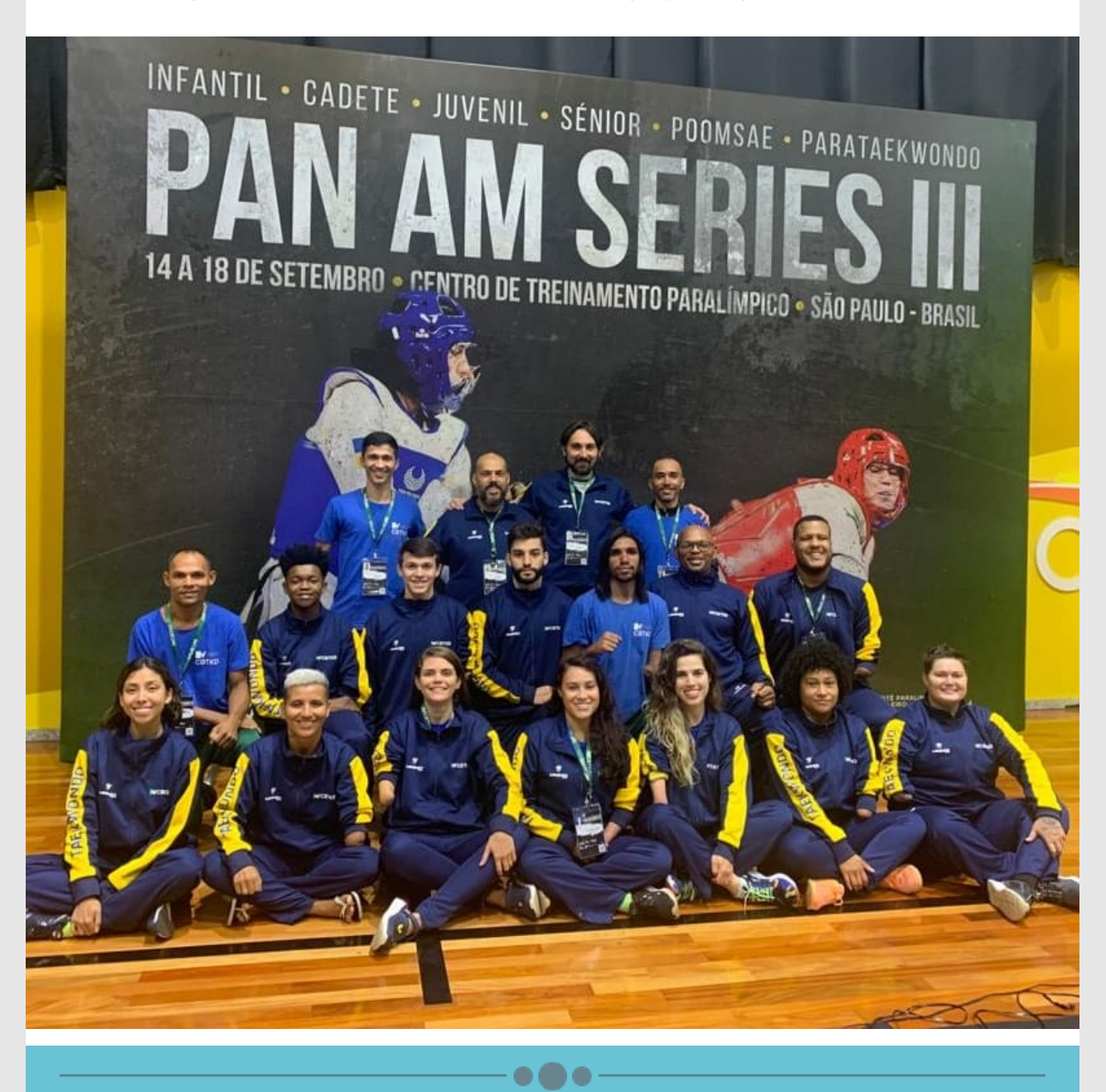
"Para Taekwondo is Better Than Ever" - Chelbat

For full coverage, please check out World Taekwondo's coverage by clicking HERE.